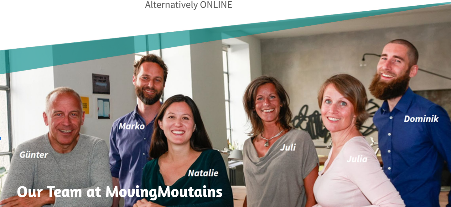
Our Team at MovingMoutains